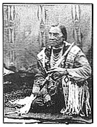
ONE WORLD TRIBE