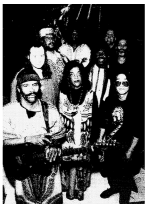
One World Tribe: 'If the music is good, they're going to come out'